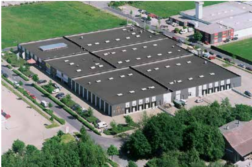
Senden Headquarters | 13,603 sqm Bahnhofstr. 73 48308 Senden Germany