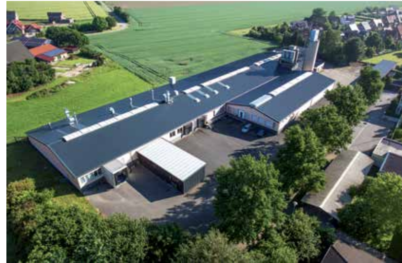
Holtwick Facility | 10,758 sqm Schulweg 23 48720 Rosendahl | Holtwick Germany